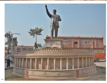
Fig. 2. Makeover of street leading to Golden.