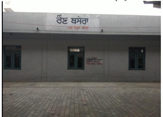
Fig. 9. Night shelter underneath the bridge.

Damoria rail over bridge : The bridge built the railway station Jalandhar; it has ample space underneath it but was not utilized until the beautification project started.