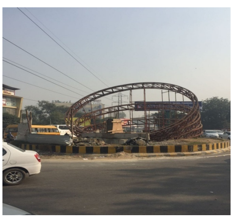
Fig. 7. Entry gate of Jalandhar city.

Entry gate of Jalandhar at B.S.F CHOWNK: While coming from the National highway 1, entry of Jalandhar is being face lifted by developing a beautiful structure on the centre verge or the roundabout.