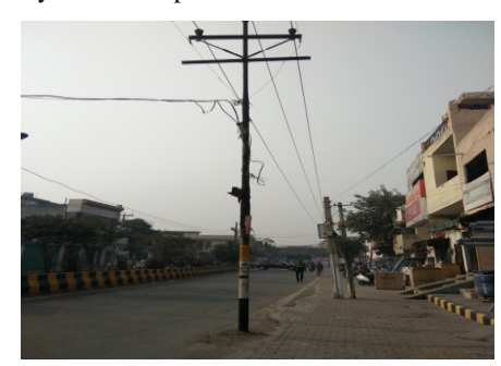
Fig. 13. Electricity in the middle of the road.

Shifting of Poles: The major hurdle in clearing the encroachments is the presence of electricity pole right in the middle of the road, the shopkeeper extend their belonging up to the electricity which may be present just in the middle of the lane, these electricity poles generally define the path on the road.