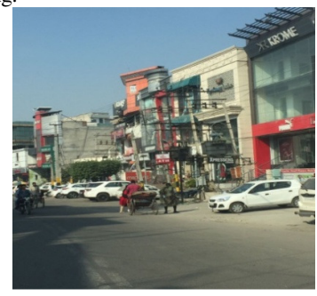
Fig. 11. Existing area of model town.

Landscaping of model town area: The motive is developing model town area from the existing chaotic area to a beautiful scenic area. For this the electricity line must be removed from the right of way (R.O.W) of the road and must be under ground. The reserved R.O.W must be lined interlocking tile and must be used for parking.