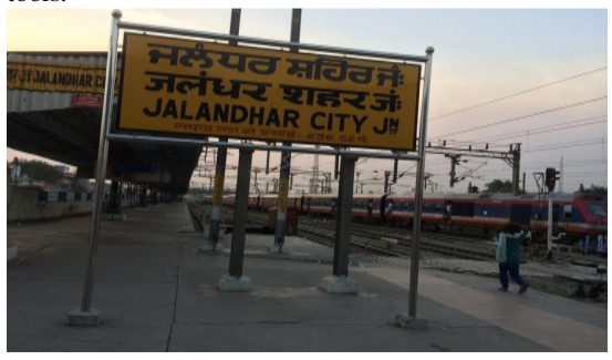
Fig. 4. Jalandhar railway station.

Jalandhar is famous for its sports industry, but also Hindustan Hydraulics who pioneered the manufacturing of high-tech CNC machines for sheet metal industry. The company has its customers not only in India but in countries like USA, Holland, Germany who are famous around the world for the manufacturing of machine tools.