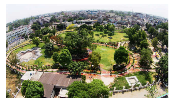
Fig. 6. After beautification project.

Entry gate of Jalandhar at B.S.F CHOWNK: While coming from the National highway 1, entry of Jalandhar is being face lifted by developing a beautiful structure on the centre verge or the roundabout.